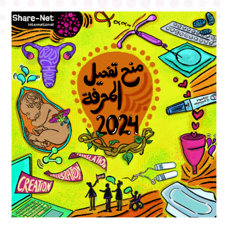
Second: Population and Development :

Applications were open on October 3, 2023 until the end of the month.